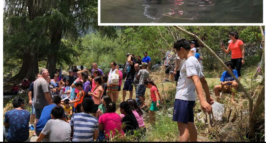
"You've made a difference in so many families. My boys have grown up in your camps. One thousand thank yous!" -a mom

And thanks to all of you that support our lives and ministry in Mexico. God bless you. all.